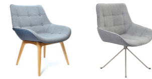
4 LEG WOOD BASE Custom upholstery with buttons 4 STAR SWIVEL BASE Custom