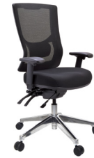
Buro Metro II HB 24/7 with arms